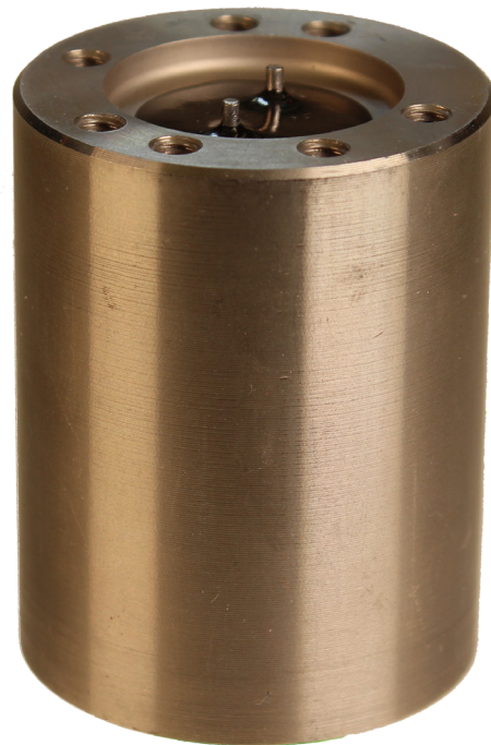
HS-1 in Steel Case