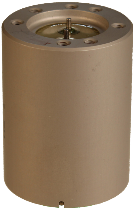
HS-1 in Aluminum Case